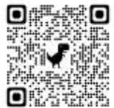
紅焰教學 工具備忘錄

Step 1 Think & Name it Look at the pictures below. Each of them represents the thing that an EFL teacher do at work. Think and name each of them.